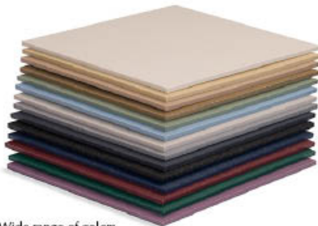
Wide range of colors